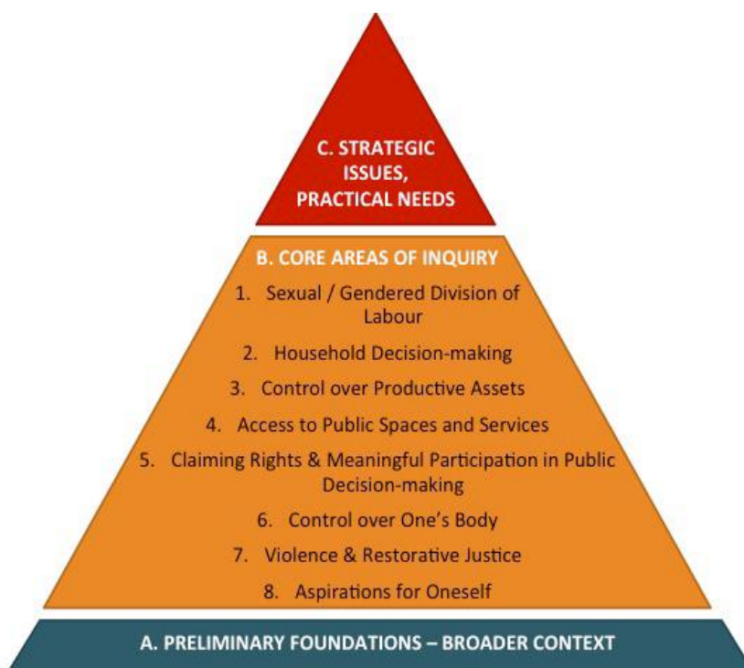
CARE's Good Practices Framework

Particular attention was paid to discussing the intersectionality of gender with other diversities that this intervention is addressing. Therefore, the aspects of age, disability, ethnicity (minorities) and urban/rural locations have been included into the equation when deciding about the content of the final tools as well as the skills and standards required for the data collection (principles of do no harm, inclusivity, and ethical issues). Since not all of the partners are expected to implement the same type of activities nor are they targeting the same type of audiences, not all of them necessarily considered the same lines of inquiry. Hence, partners adapted their selection of areas of inquiry to best correspond to their audiences and areas of activity (for example, five partners specialize in elderly care and so included a line of inquiry which focused on relevant services such as home care visits to the elderly).